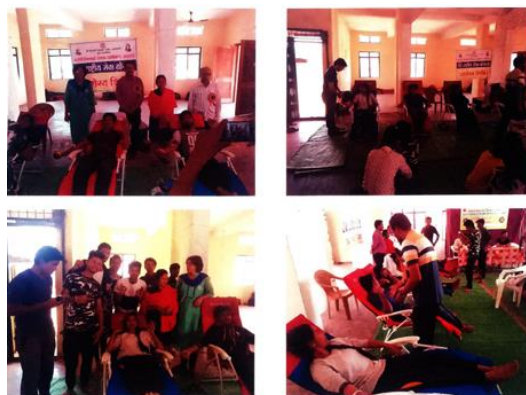
On 19 th February 2022 , A grand free dental check-up and eye check-up camp was organized in NSS Camp.