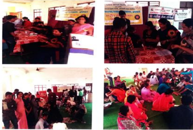
On 20/2/2019, a grand women's gathering was organized for village women in the camp and blood group screening was organized.